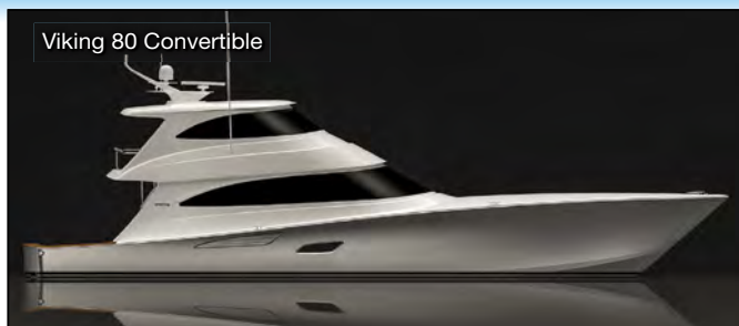
Viking 80 Convertible