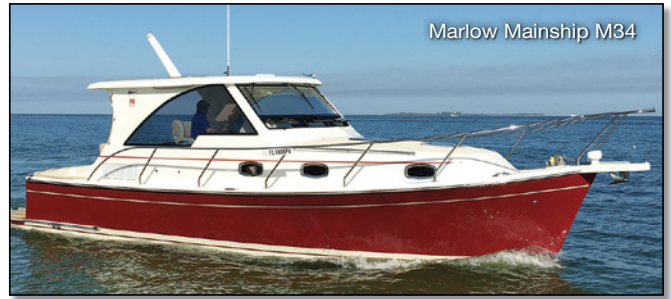
Marlow Mainship M34