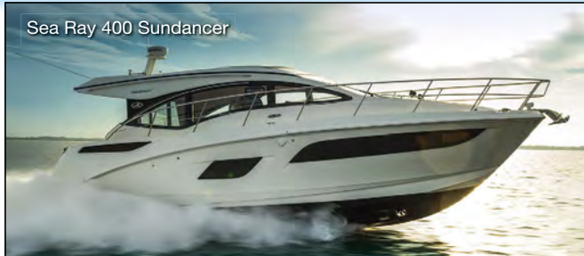
Sea Ray 400 Sundancer