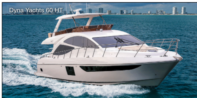
Dyna Yachts 60 HT