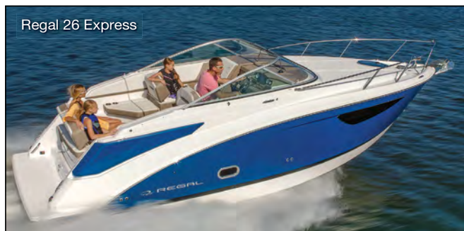
Regal 26 Express

size has grown. It's no surprise, then, that the new flagship from Pursuit is the S408, a 43-footer with a 13-foot beam that can harness up to 1,050 horses. Designed for offshore anglers and families alike, it has a true center console footprint, plus the Pursuit Sport line of amenities such as a cabin, cockpit seating and a fiberglass hardtop with radar, antenna and outrigger. Pursuit will showcase another new model in Miami, the DS295 Dual Console (LOA 31' 9", beam 9' 10"), which features an integrated hardtop, convertible seating and product-specific storage. Pursuit's signature fit and finish are present in both models right down to the powder-coated supports for the hardtop. pursuitboats.com