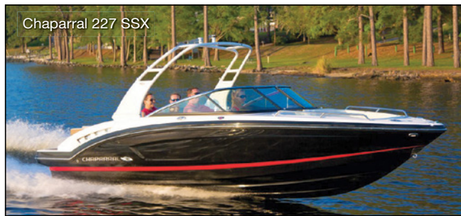
Chaparral 227 SSX

for more than five decades, and this year the company has as many as four new models on display, including the 210 Suncoast (LOA 20' 10", beam 8' 6"). The 210 was created for those who want the performance of a planing V-bottom hull and the passenger capacity of a pontoon. With an outboard mounted far back on the transom, the 210 is equipped to deliver more usable deck space than a similar craft powered by a sterndrive. Outboard power provides brisk performance, too. This Chaparral has been clocked at close to 48 mph with a 200-hp Mercury Verado. As for passenger capacity, the 210 is rated for up to 10 people all of whom can get comfortable in lounges forward and aft. We like the bow seating, which is relatively roomy because beam is carried far forward. A head compartment makes the boat family friendly. Other new