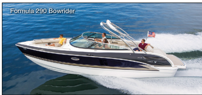
Formula 290 Bowrider

a trio of F300s, with a maximum horsepower rating of 900. Outboards push what the company calls its most sophisticated twin-step hull design to date. Advanced construction techniques are used throughout the boat. The integrated windshield hardtop, for instance, is built with carbon materials rather than traditional aluminum tubing. At 38' 8" LOA and with a beam of 11' 4", the 368 has the comforts of a day cruiser—note the wraparound lounge in the bow and mezzanine cockpit seating, plus the executive jet-style cabin with galley, head and convertible dinette—along with the performance and range of a highly efficient fish boat. Other new models to look for are the 248 CX dual console (LOA 24' 6", beam 8' 6"), and the 262 Center Console (LOA 26' 5", beam 9' 3"). ewboats.com