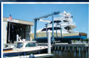
Dockage & Storage

Full Service Yacht Repair For All Makes and Models