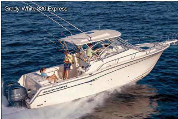
Grady-White 330 Express

Here's a company that doesn't believe in resting on its laurels. Grady-White's 330 Express has been one of the builder's most popular designs, but it's been redone for 2015. The refreshed model could attract those who have never owned a Grady-White, along with owners of existing Express 330s. Among the updates are enhanced seating throughout the boat, a new lighting system that brightens all spaces, more entertaining features in the cockpit (including refrigerator