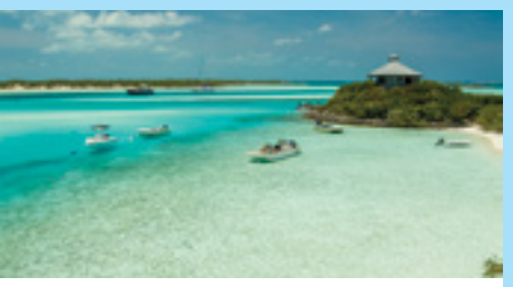
APRIL-The Bahamas Issue